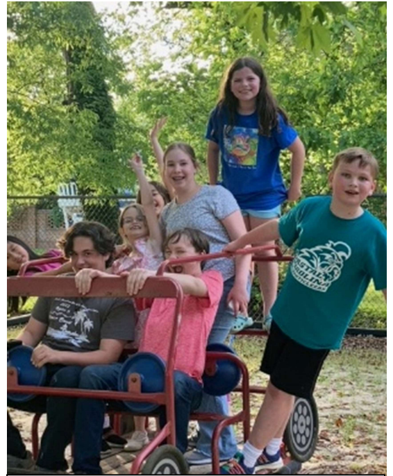
Fun Times with Fireflies & Youth