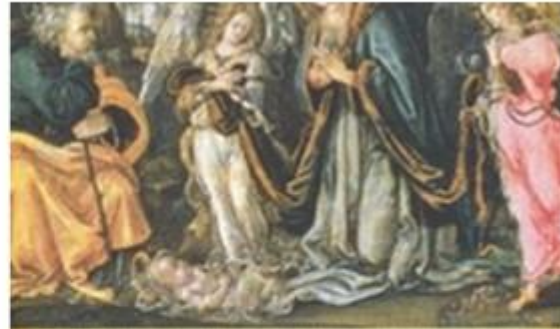
The Angels of Christmas HEARING GOD'S VOICE IN ADVENT