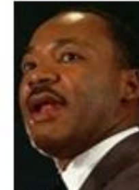
M L King, Jr