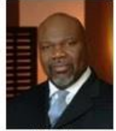
T D Jakes