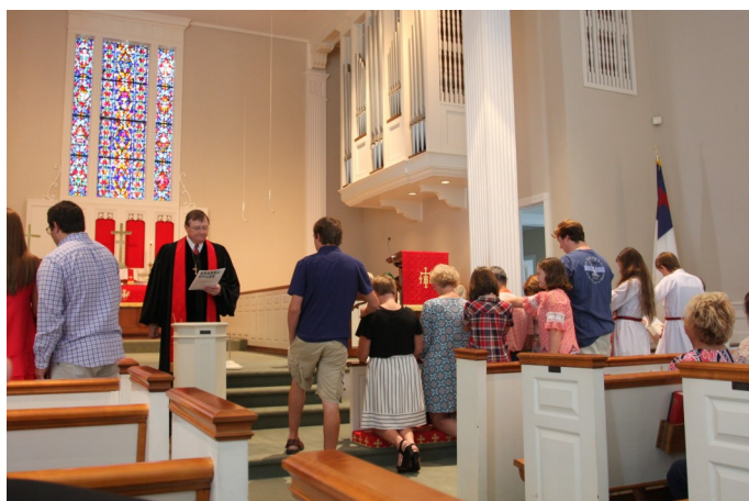
Blessing of the hands ceremony for the teachers and students going back to school.