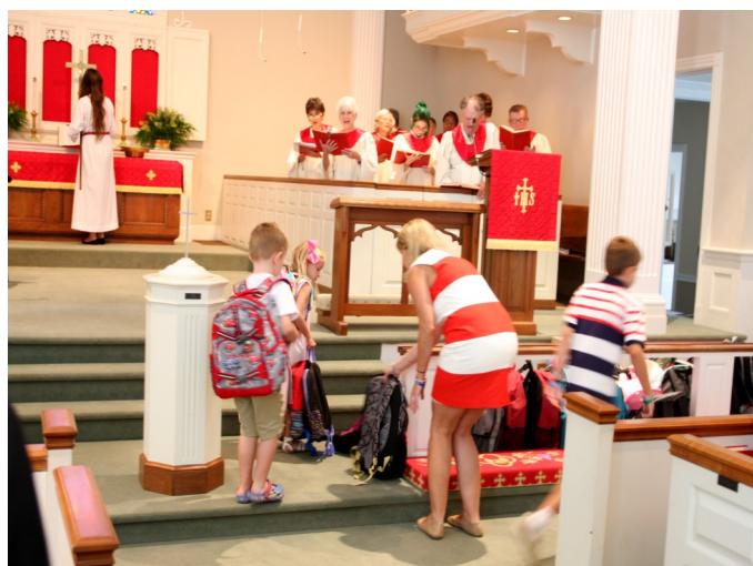
Back-packs being brought to the altar.