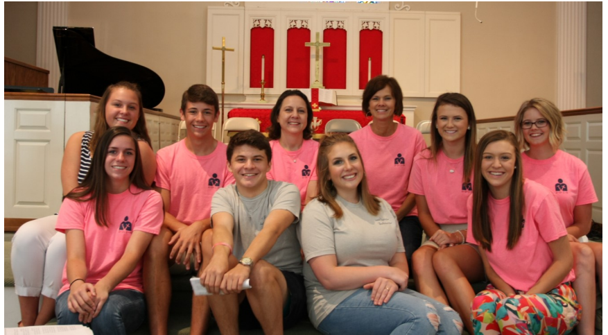
Commissioning Service for Salkehatchie Participants