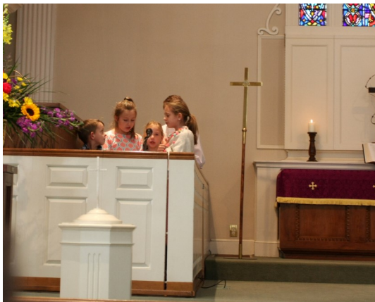
Children singing during worship.