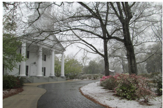
Late Winter snow at FUMC on March 12, 2017