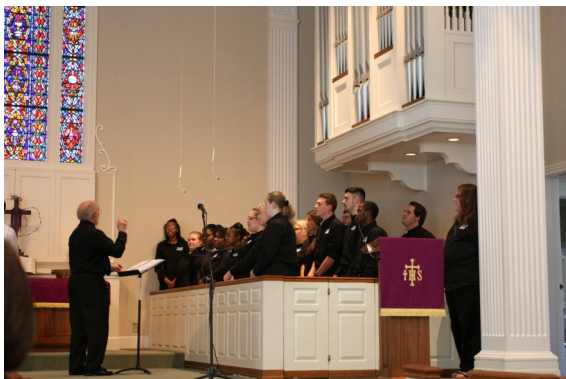
Spartanburg Methodist College Choir sings for FUMC