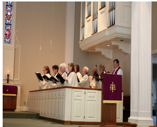
FUMC Adult Choir sings during worship.