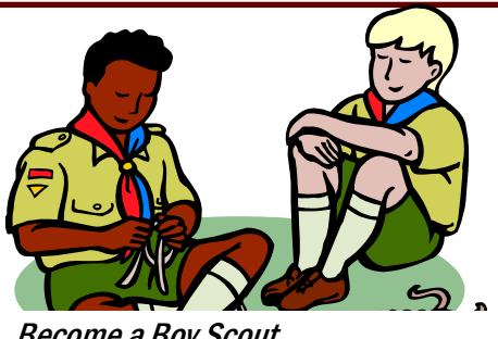
Become a Boy Scout

Charter Representative, Phone number 843-537-2553