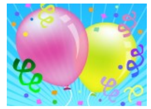
Happy Birthday and Happy Anniversary