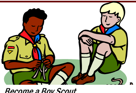
Become a Boy Scout

Charter Representative, Phone number 843-537-2553