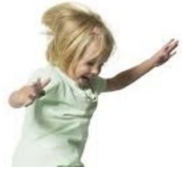
The children have had fun on splash days ....