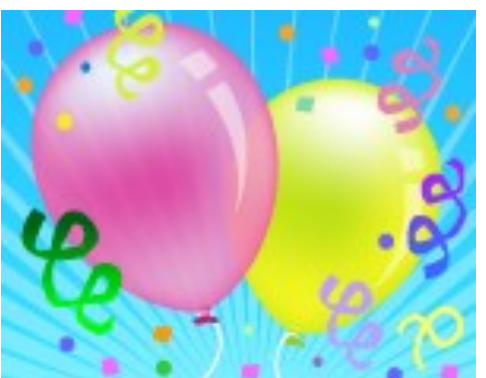
Happy Birthday and Happy Anniversary