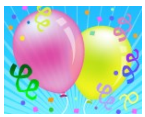
Happy Birthday and Happy Anniversary