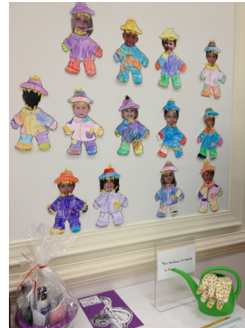
Pictures of our First UMC pre-school children decorated the walls at the recent Dinner and Silent Auction.